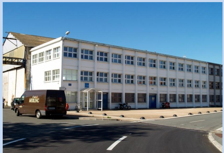
Photo of the north facade

Port area: PRCN Address: 1 rue de la Côte d'Ivoire Access: RN 237 (2x2 lanes), International Airport La Rochelle-Ile de Ré 5 minutes, TGV 2h50 minutes from Paris Site: In the immediate vicinity of the southern and dry docks